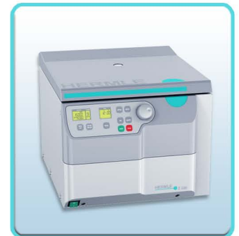
Z326 Universal Centrifuge