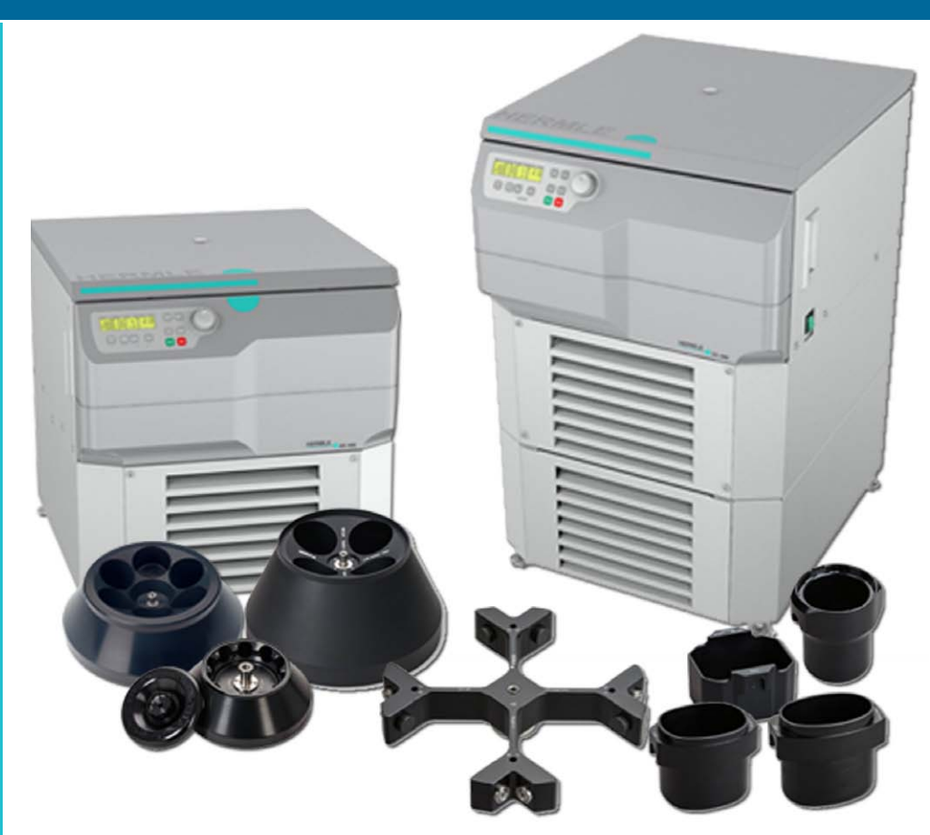
The Z496-K centrifuges offer the highest tube/bottle capacity in our range.

Power Draw: 2300 W Temp Range: -20° to 40° C