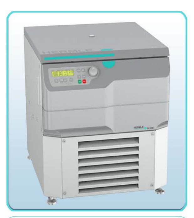
Z496-K Underbench model