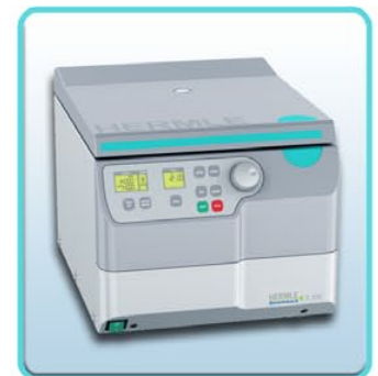
Z306 Universal Centrifuge